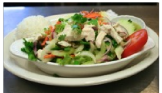
# 10 CHICKEN LIME SALAD

Fresh lettuce, tofu, celery, carrots, and cilantro, and onion mixed with house lime sauce.