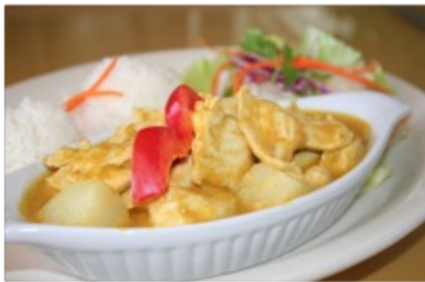
# 5 CHICKEN CURRY