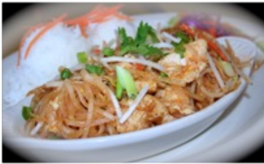
# 32 PAD THAI

Chef's special BBQ pork stir-fried Thai jasmine rice with egg, carrots, onions, tomatoes and celery.