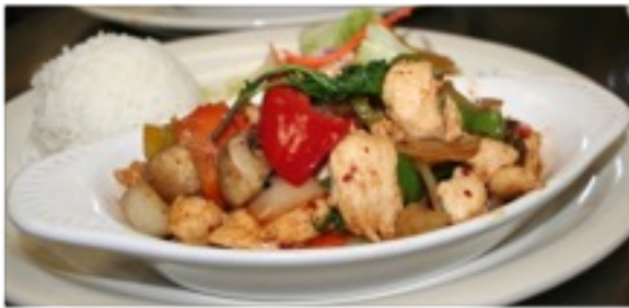
# 14 SPICY BASIL