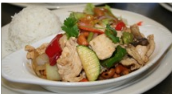
# 15 CRAZY CASHEW