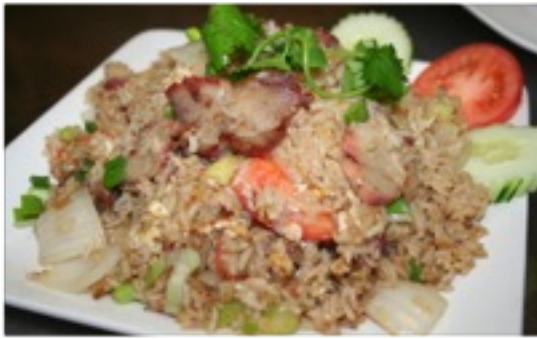
# 31 BBQ PORK FRIED RICE