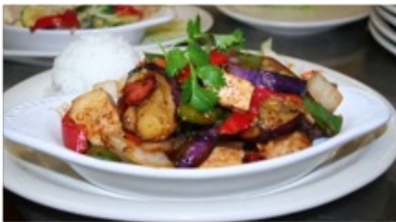
# 24 SPICY EGGPLANT