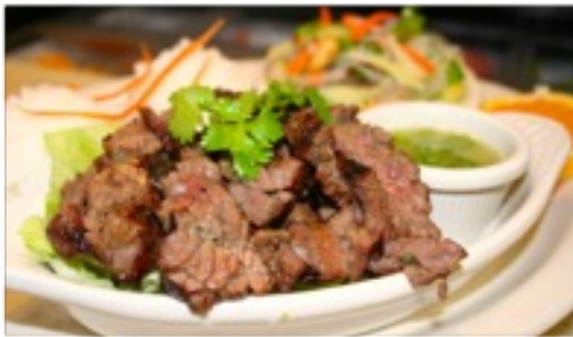
# 1 CRYING TIGER

** choice Vegetables only or Vegetables and Tofu ** Mixed fresh vegetables only, or veggies and tofu with a yellow curry coconut sauce.